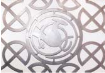
Right Steel and chrome gates flanking the Treasury Gallery