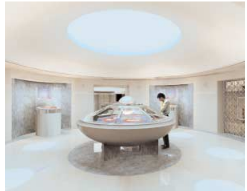
Below View of the Pearl Collection gallery

The Museum of Pearls, presently under construction, is designed to house the collection of Sultan Ali Al-Owais and will represent the largest display of natural pearls in the world. Located within the headquarters of the National Bank of Dubai, the museum will also include displays of traditional diving equipment, artefacts related to pearl dealing, and historic currency of the region. The Museum of Pearls is scheduled for completion in 2002.